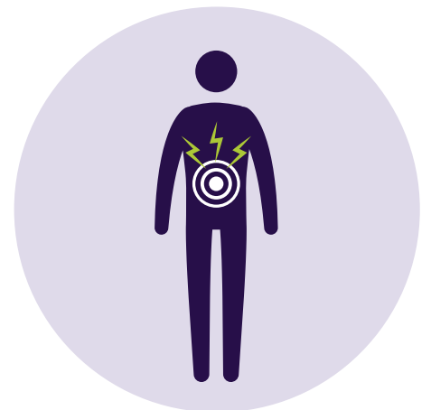
NAUSEA, VOMITING, OR DIARRHEA