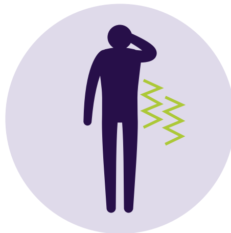
MUSCLE OR BODY ACHES